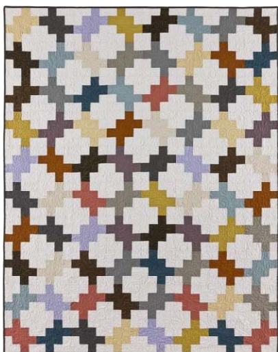
EARTH 64" x 80"