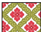
Fabric 6..... MAS8409-P .....FQ