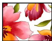
Fabric 1..... MAS8400-W .....FQ