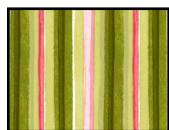
Fabric 4..... MAS8408-GP .....FQ