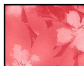
Fabric 13... MAS8406-PR .....3/8 yd for inner border