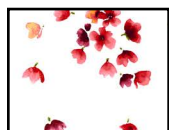
Fabric 2..... MAS8404-W .....FQ