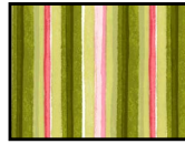
Fabric 15... MAS8408-GP .....3/4 yd for binding