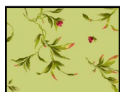
Fabric 7..... MAS8407-G .....FQ