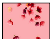
Fabric 5..... MAS8404-P .....FQ