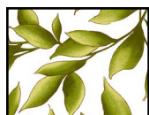
Fabric 3..... MAS8403-W .....FQ