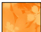
Fabric 11... MAS8406-SO .....FQ