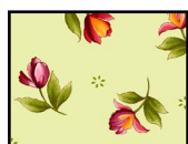
Fabric 10... MAS8405-G .....FQ