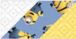
Make 26 [B] units