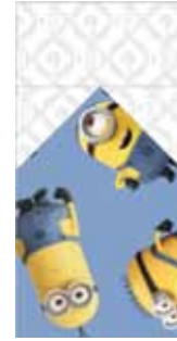
Make 2 [C] units