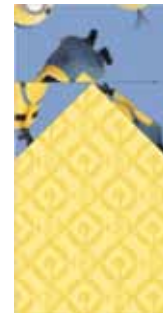
Make 2 [D] units