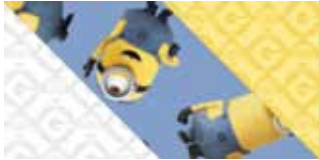
Make 26 [A] units