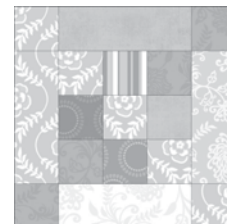
Pear Block B