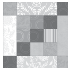
Pear Block A

These instructions are to make 1 block. Refer to the block diagram for piece placement. Sew 9 assorted print 2½" squares together to create the nine-patch center. (There will be 8 Block A centers and 4 Block B centers.) Sew an assorted print 2½" x 6½" rectangle to each side of the nine-patch center. Sew an assorted print 2½" square to each end of 2 assorted print 2½" x 6½" rectangles. Sew these to the top and bottom of the block to finish the Pear Block. Repeat to make a total of 12 blocks (8 Block A and 4 Block B).