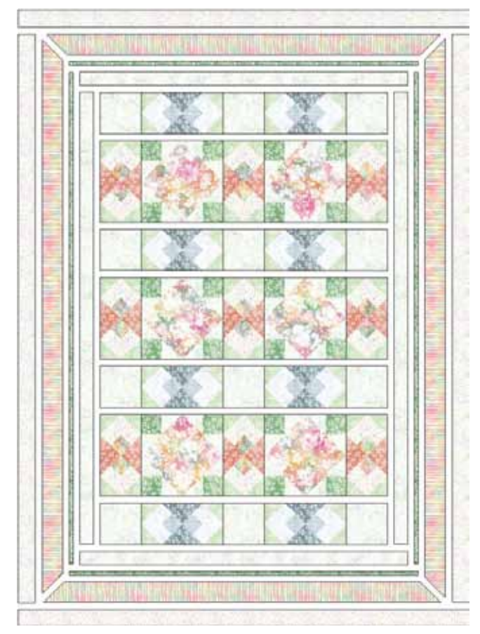
Exploded Throw Diagram