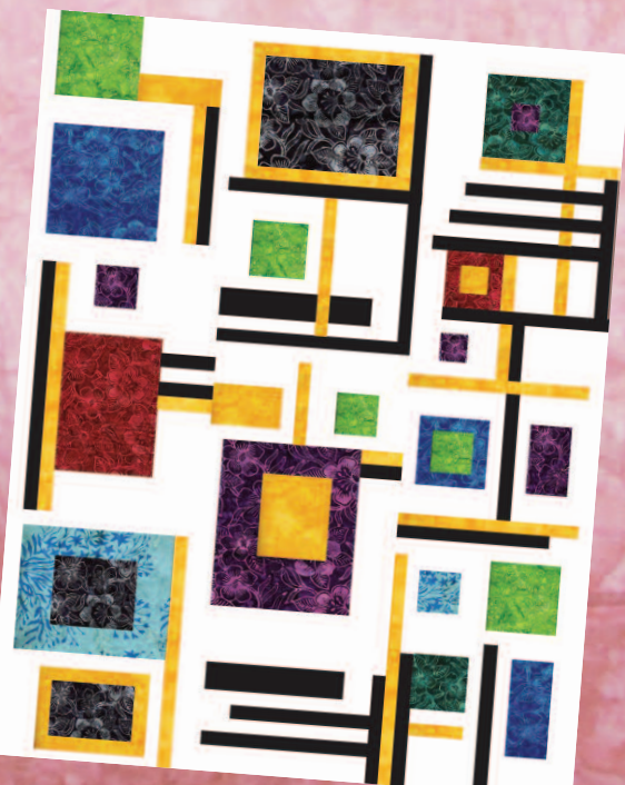
Moderno in Balis Janet Page Kessler FINISHED SIZE: 42" x 54" Uses Confections and Costa Luna Balis