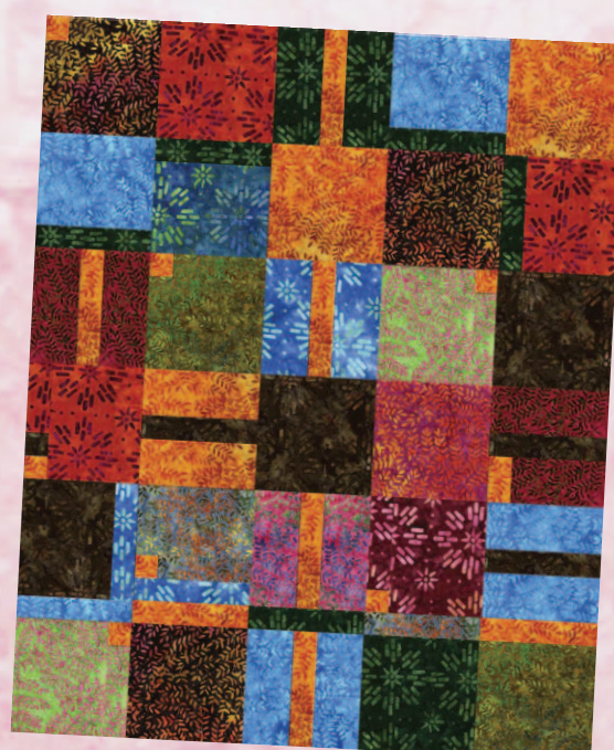
Parrot Haven Janet Page Kessler Finished Size: 47-1/2" x 59" Uses Parrot Cove Balis