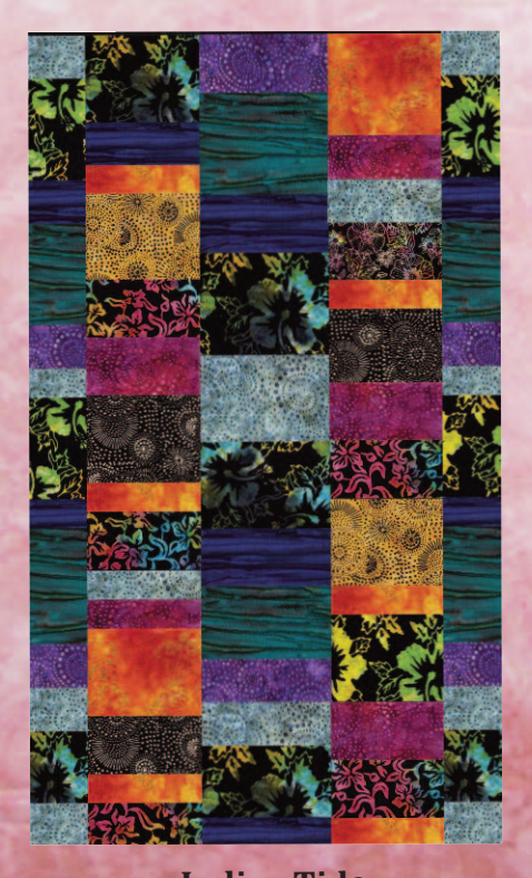
Indigo Tide Janet Page Kessler Finished Size: 33" x 56" Uses Serenity, Sedona, and Dark Secret Balis