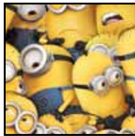
23989 S (Backing)