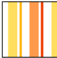
23993 O (Binding)