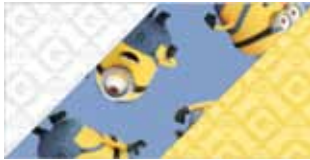
Make 26 [B] units