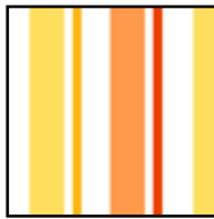
23993 O (Binding)