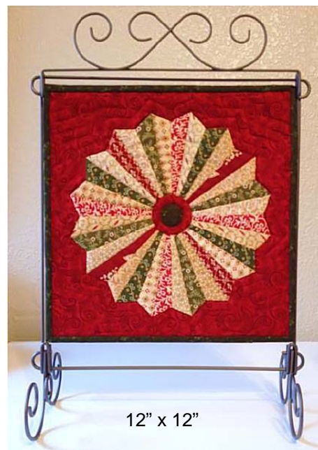
12" x 12"

3. Quilt as desired and bind with the 2" dark green strips. Press a double 1/4" hem onto each end of the hanging sleeve. Press in half, wrong sides together. Center and align the hanging sleeve with the raw edges along the top raw edge of the quilt and stitch just inside the seam line. Hand stitch the folded edge of the sleeve to the back of the quilt.