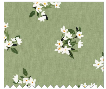
CX7144 Leaf Lily of the Valley 5/8 yard