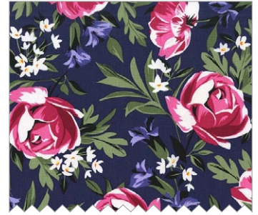
CX7143 Sapphire Bed of Roses 3/8 yard