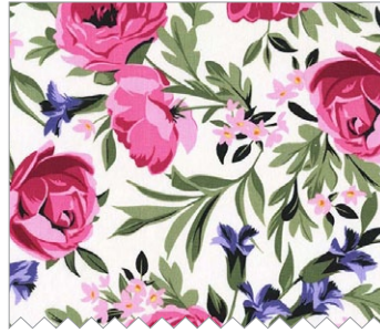
CX7143 Rose Bed of Roses 1/4 yard