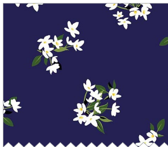
CX7144 Sapphire Lily of the Valley 3/4 yard