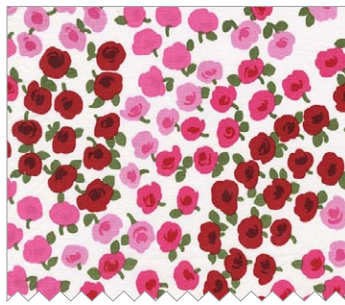
CX6899 Red Ava 3/8 yard