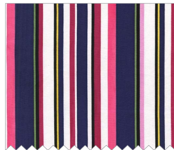
CX7146 Sapphire Briar Path 1/4 yard