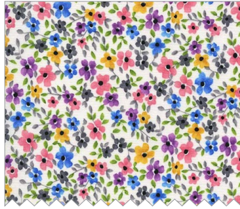
CX6886 White Forget Me Not 1/4 yard