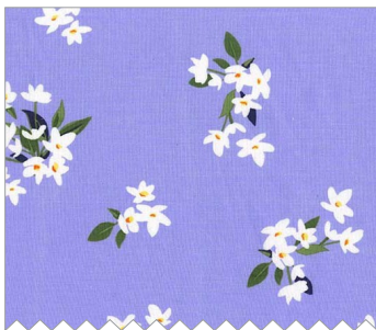
CX7144 Opal Lily of the Valley 5/8 yard