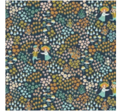
MEADOW FROLIC DUSK