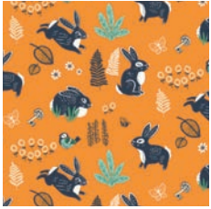
BUNNY HOP ORANGE