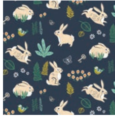
BUNNY HOP DUSK