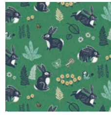
BUNNY HOP GREEN