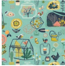
GLASS HOUSE (backing - not included as an applique leaf)