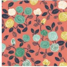
ROSES CORAL (binding)